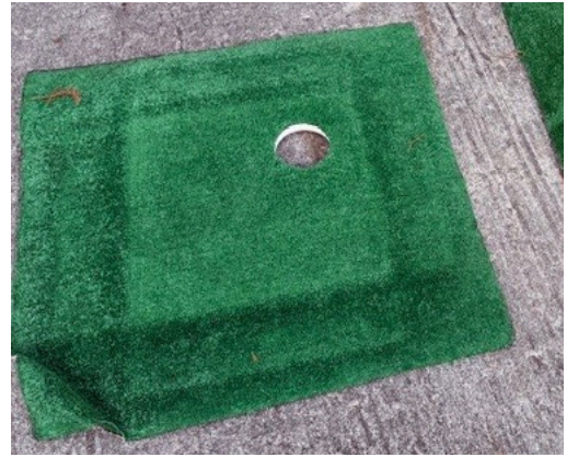
Hole Cup #8