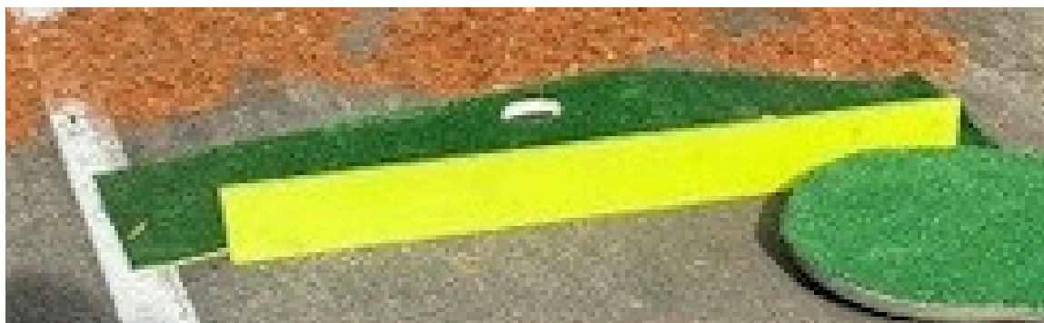
Hole Cup #16