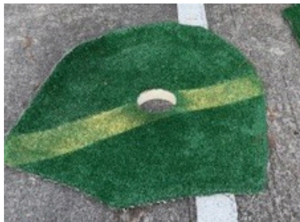
Hole Cup #6