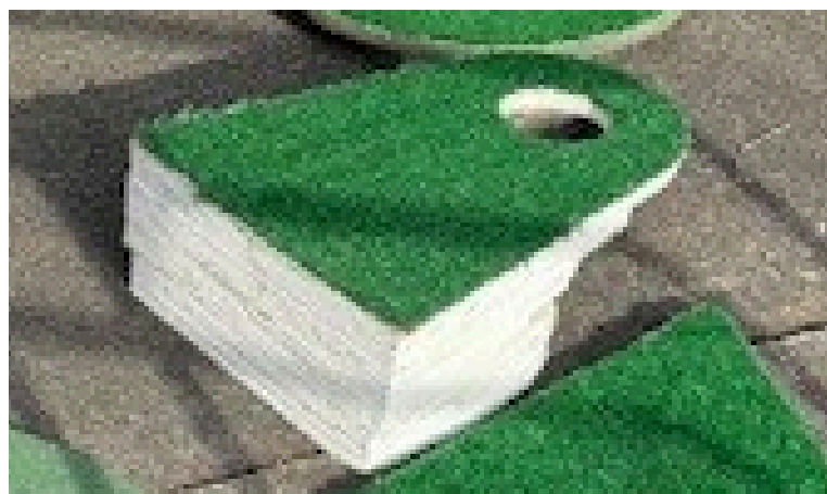
Hole Cup #15