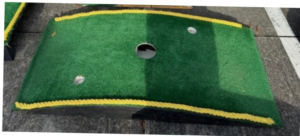
Hole Cup #11