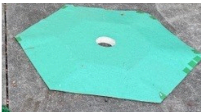
Hole Cup #5