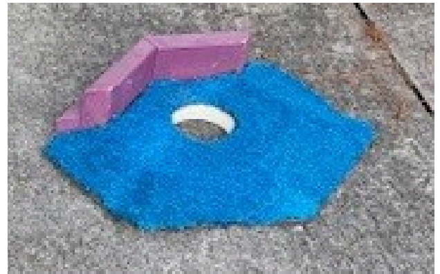
Hole Cup #10