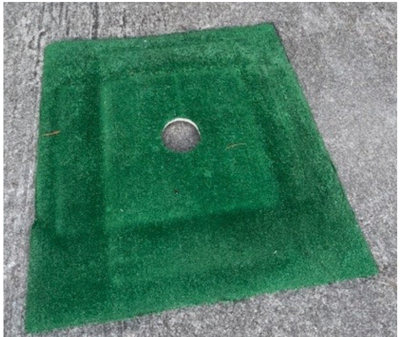
Hole Cup #13