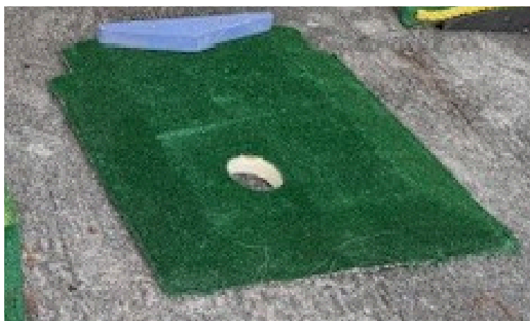
Hole Cup #4