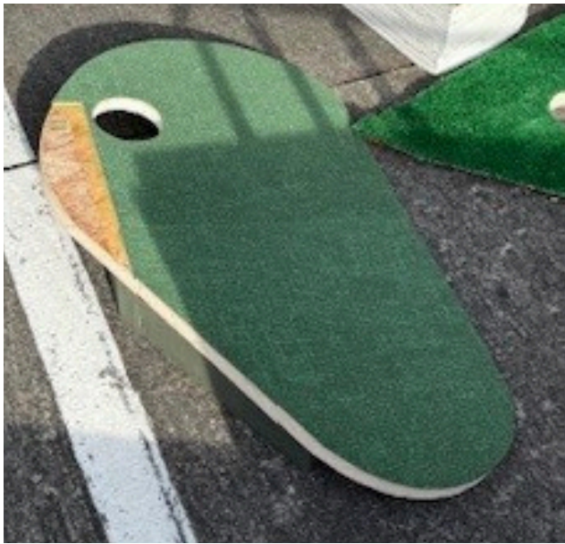
Hole Cup #12