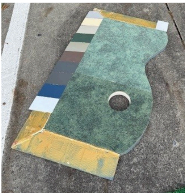
Hole Cup #3