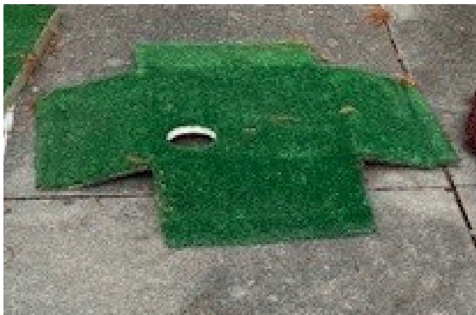
Hole Cup #1