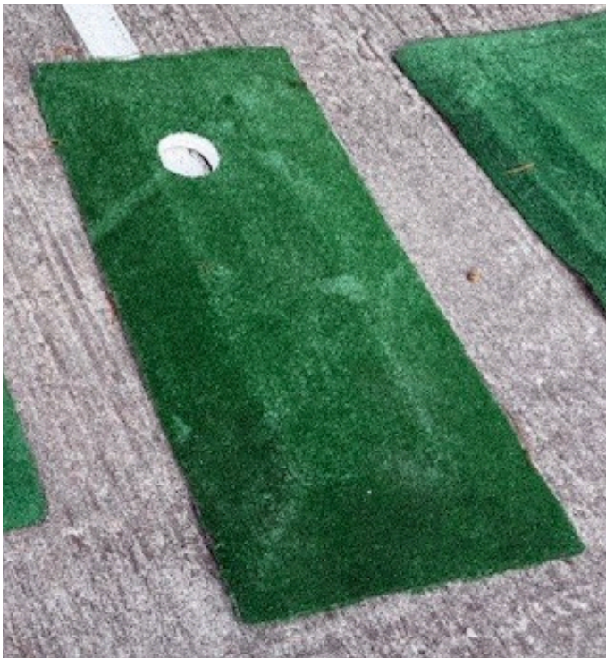
Hole Cup #9