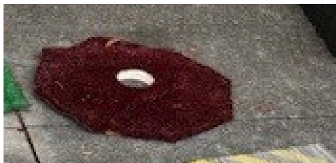
Hole Cup #2