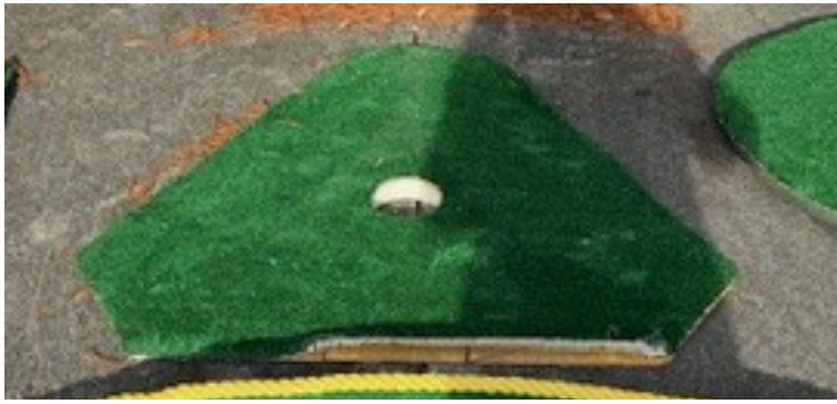
Hole Cup #7