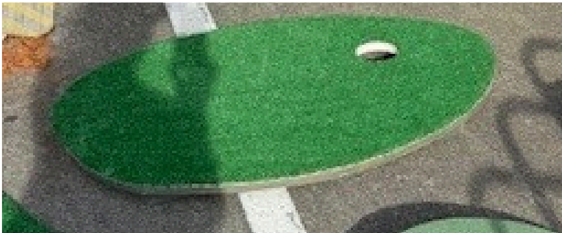
Hole Cup #14